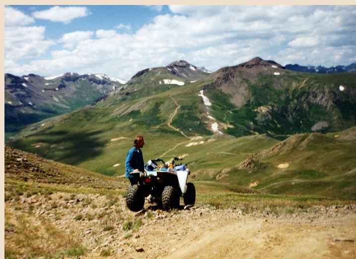
Access to the high country requires drivers to be aware of safety and the need to protect the fragile alpine tundra.