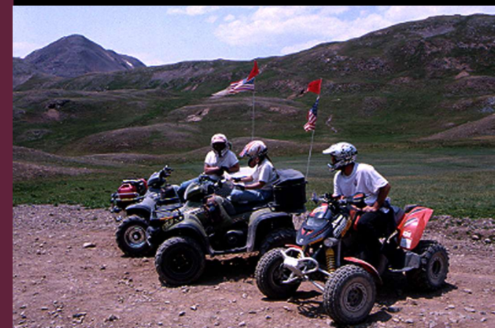
To protect fragile alpine areas, stay on legally designated routes.