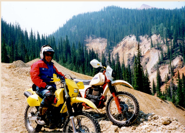
Motor vehicles are required to stay on routes identified on this map.

Welcome to the Alpine Backcountry, one of the finest examples of our nation's Backcountry Byway system. Seventy-five miles of road carve through the breathtaking San Juan Mountains connecting the towns of Lake City, Ouray, Telluride, Ophir, and Silverton. Routes through the mountains follow ancient paths worn by Native Americans traversing the region as they returned to traditional summer camps. In the late 1800s, miners in search of precious metals widened these paths to accommodate horse- and mule-drawn wagons and built additional roads to access mines. Today, the remains of ghost towns, mines, mills, aerial trams, and railroads, are prominent reminders of the region's extensive mining history.